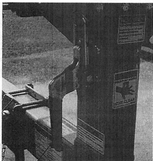
① PRIMARY LATCH